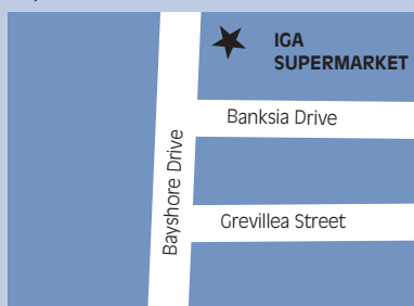
BYRON BAY Byron West Shopping Centre, Bayshore Drive