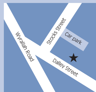
LISMORE St Vincent's hospital, Dalley St